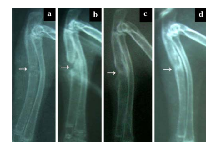
Fig. 1 Radiographs of rabbit ulnar defects (arrow showed). (a) Resorption and few bone regeneration could be detected in defects with CPC containing 25% ACB particles 8 weeks after operation. (b) Bone regeneration connecting both defect ends could be detected with CPC containing 25% ACB particles 12 weeks after operation. (c) Defects were filled with trabelulous bone with CPC containing 75% ACB particles 12 weeks after operation. (d) Defects were filled with regeneration bone with CPC containing 100% ACB particles 12 weeks after operation.

Through manual palpation examination, there were no bony connection of all samples at 4 and 8 weeks in every group. At 12 weeks, bony connections between the original bone ends were observed in 0, 3, 6, 8 ulnar samples of 0%, 25%, 50%, 75%, 100% volume ACB/CPC group, respectively. No significant difference was observed between 75% and 100% volume ACB/CPC group (P > 0.05).